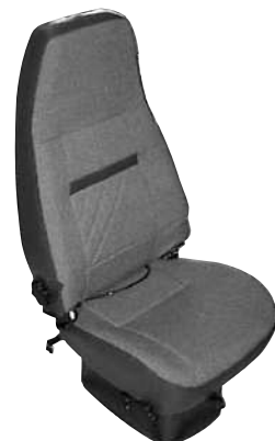
BOSTROM RouteMaster + Aire